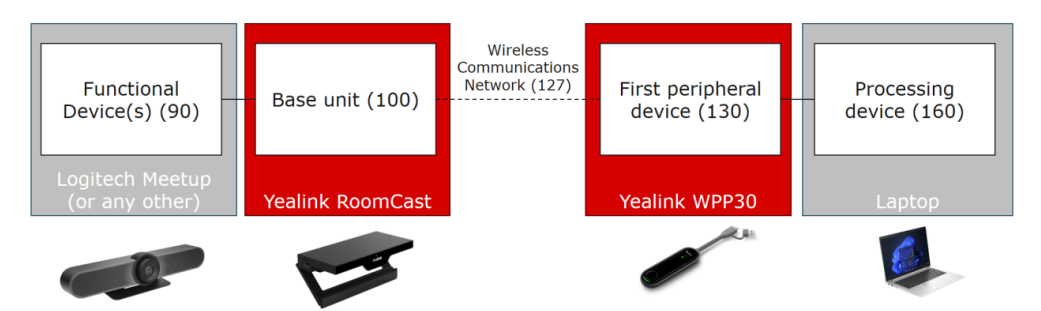
Diagram mapped on the Yealink Set Up including the RoomCast and stand-alone video/audio device